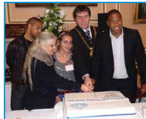
Cutting the Plain English Cake

of place – "We'll put some plain English into their mouths and they'll love it", she said.